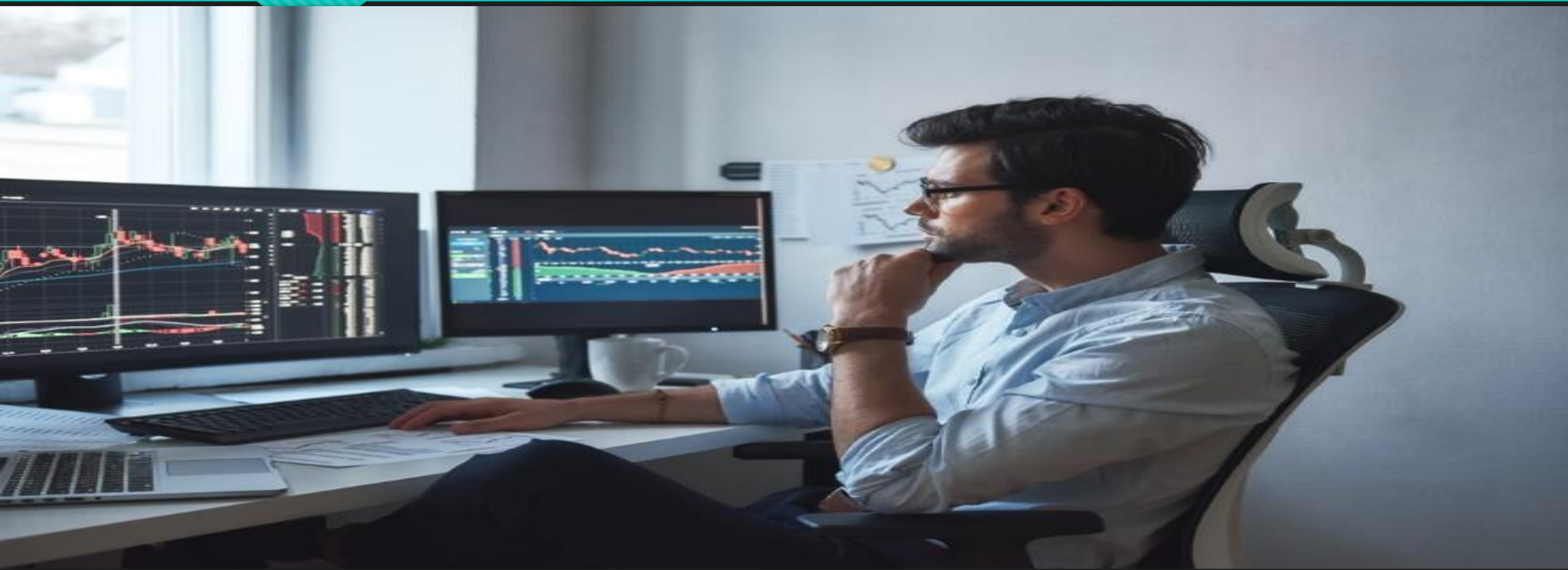
Chart-Master FX [Think like an institutional trader]